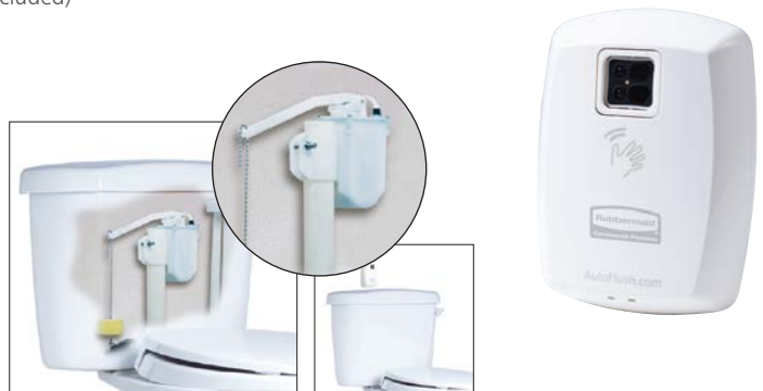
Mount motor in tank and attached to flapper.